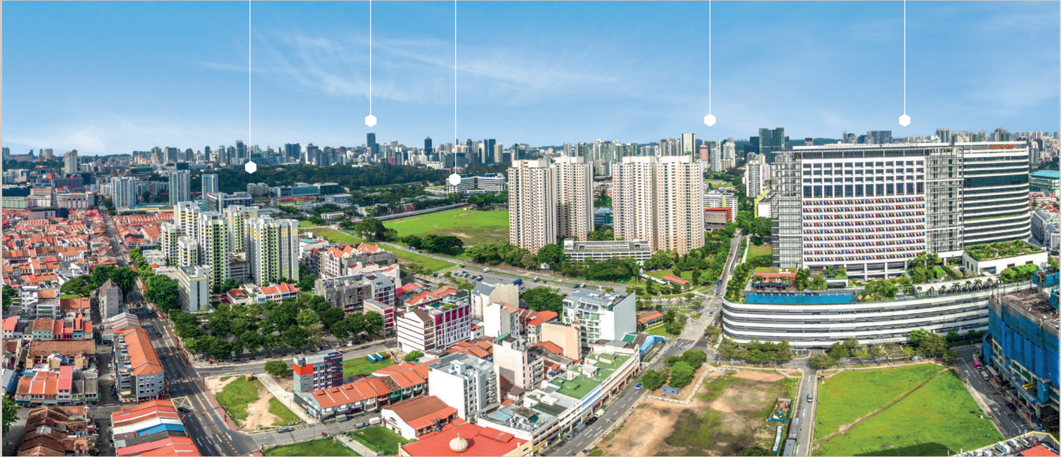
Actual View From West Facing