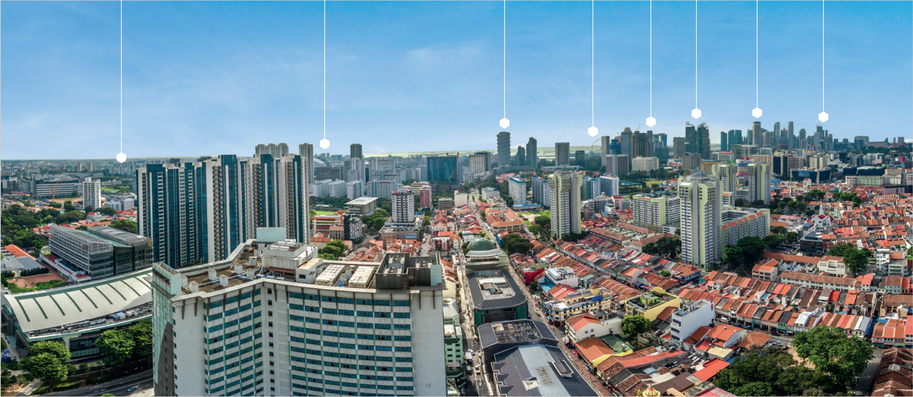
Actual View from South Facing